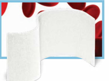
2.5 cm x 7.5 cm, 1 mm thick Cat. No. 0100Z