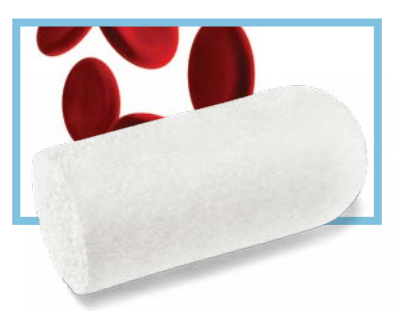
10 mm x 20 mm Cat. No. 0102Z