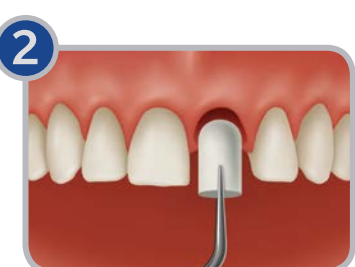
Modified Zimmer Collagen Plug delivered to protect grafted site.